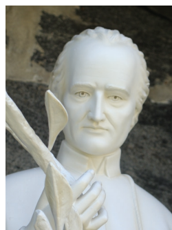
BLESSED BASIL MOREAU beatified on September 14, 2007